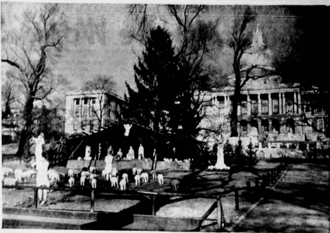
STATE HOUSE in Boston forms background for large creche, familiar sight each year on historic Boston Common.

CHURCH HISTORY, however, shows that consecration as a deaconess was never compared with priestly ordination, any more than the present consecration of virgins and abbesses. Moreover, no one can seriously maintain that all Christian service in the Church was closed to women simply because the institution of deaconesses did not survive in its original form. Instead, it developed into a variety of